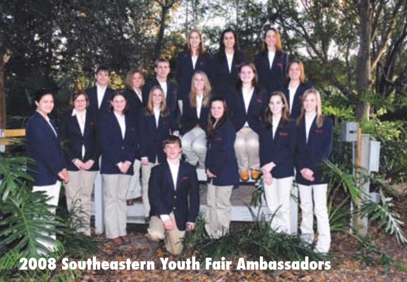
2008 Southeastern Youth Fair Ambassadors

ion will get two new entry ways – one on the east and one on the west side of the building, each with bathrooms, a ticket booth, and concessions. The Extension Service is selling commemorative brick pavers that can be personalized for $100 each. The pavers will line the entry to the new reception hall and the livestock auditorium. (More details are available at: www.marioncountyfl.org )